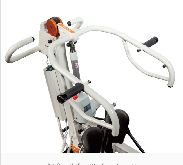
Additional sling attachment points