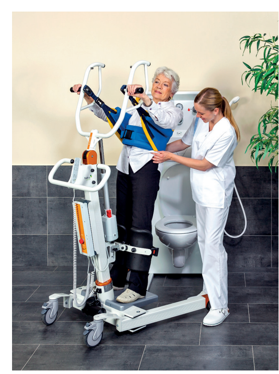
Relieve your caregivers, activate your residents!

The NORA Alu stand-up and raising aid was specially designed for residents who still have the ability to stand for a short time with the help of supporting tools. The active ift is ideal for transporting residents safely and comfortably without putting any strain on the back of the caregiver.