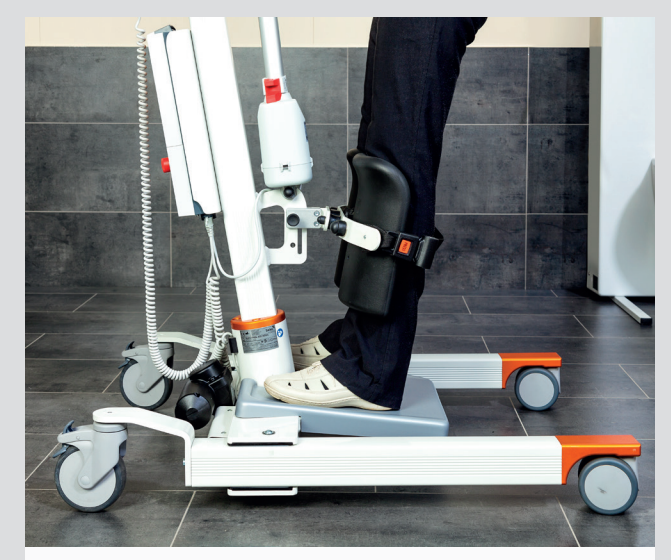
Flexible, height-adjustable knee pads with safety belts, specially adaptable to smaller residents