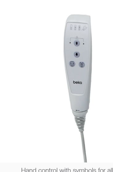
Hand control with symbols for all functions and display of the battery status