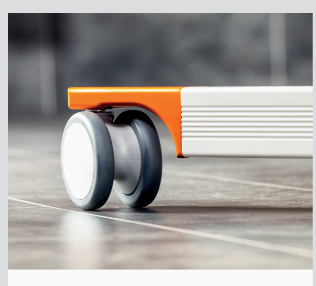
Highly maneuverable castors, two of them with brakes