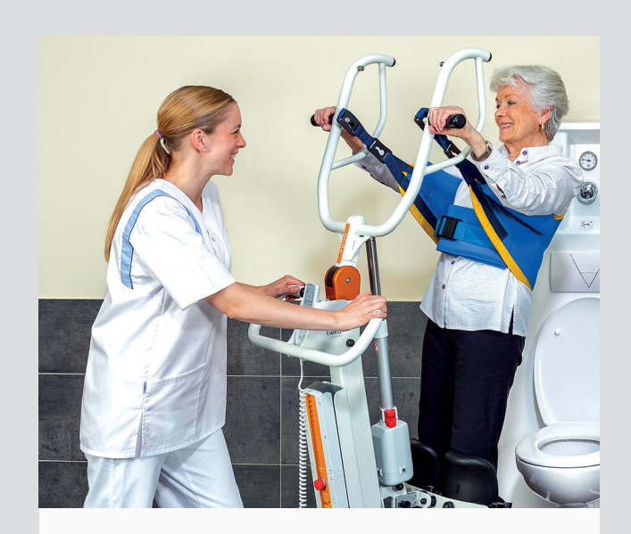
Ergonomic grip handles for both, caregiver and residents