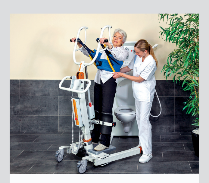
Suitable for toileting and showering the buttom area